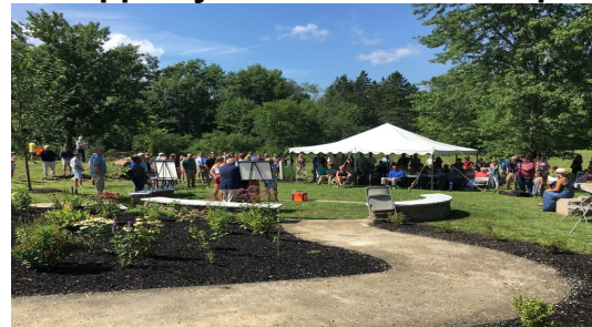
Dedication Ceremony