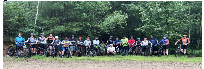
First bikers ever on the trail – ready to roll

To all you volunteers who helped make this a reality, Thank You! You gave your time and energy to make more trails available in Epping. We are grateful!