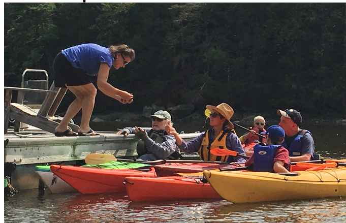
Eco-paddle participants check out baby oysters.