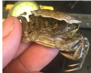
Green crab starting to molt

insects exit the shell by pushing up and out; thorax first, then the head, and the abdomen last. Crabs break their shells side to side behind the carapace and the animal must back out. Spiders and their marine cousins, horseshoe crabs, break their exoskeletons at the front edge of the cephalothorax and exit from the front.