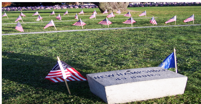
NH graves at Soldiers' Cemetery in Gettysburg

The Civil War Roundtable of New Hampshire welcomes anyone with an interest in the American Civil War who would like to be with others who share the same desire to learn more of this time in American history. We are an informal club with the only requirement being a Civil War enthusiast. If you or a friend has an interest in the American Civil