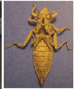
Dragonfly nymph molt

When an animal first leaves its exoskeleton, it is soft and very vulnerable. Even the pinchers of crabs, when soft, are of no use. People take advantage of this when they eat "soft-shell" crabs; just boiling and then eating them whole, shell included. After molting, most creatures find a protected hiding place and wait until their new exoskeleton hardens.